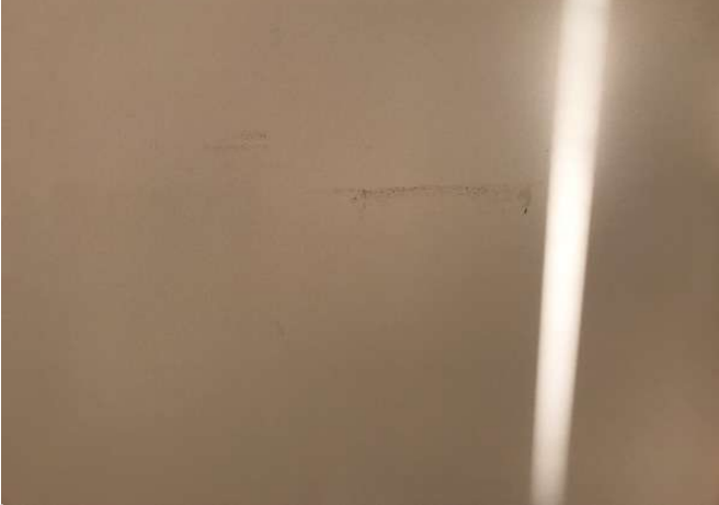
Scuff marks to wall

09-08-2025 15:31 / Walls Ceilings / 489suqm47