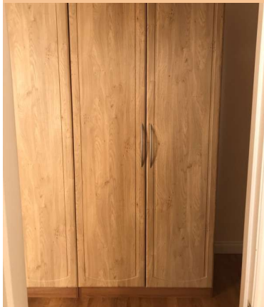
22-11-2024 15:30 / Landlord Furnishings / Rbe70lxwr