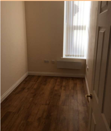
03-04-2025 15:35 / Bedroom Heating / F3ubdriak