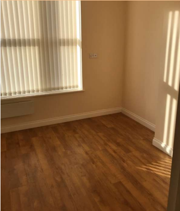
03-04-2025 15:34 / Bedroom Heating / 7ixc1zos1