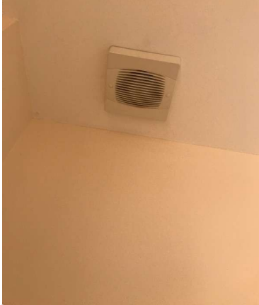
Dusty on inspection, advised tenant to clean to avoid breaking

09-08-2025 15:39 / Extractor Fan / Ebof2wpj2