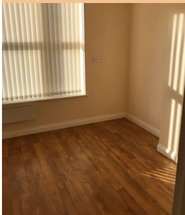
22-11-2024 15:34 / Bedroom Heating / 7ixc1zos1