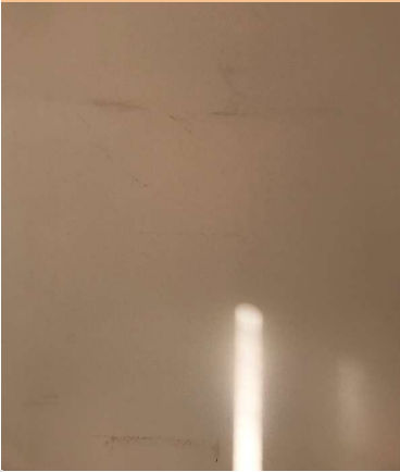
Scuff marks to wall

09-08-2025 15:31 / Walls Ceilings / Ujko881rt