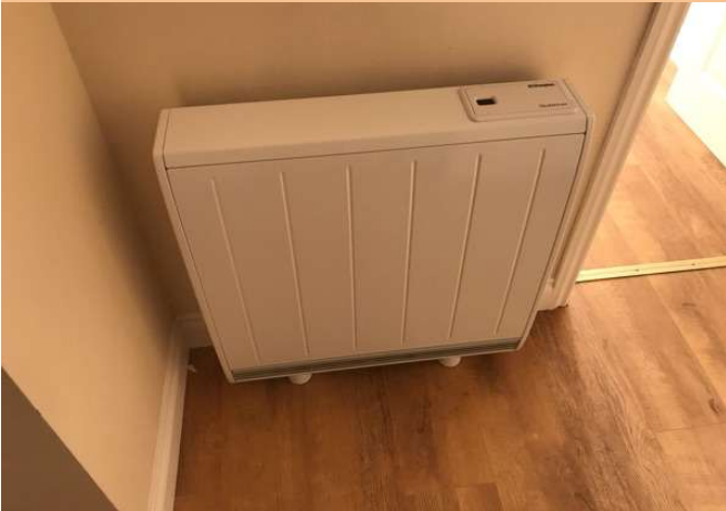
03-04-2025 15:30 / Hallway Photo / Ad4mmbh7p