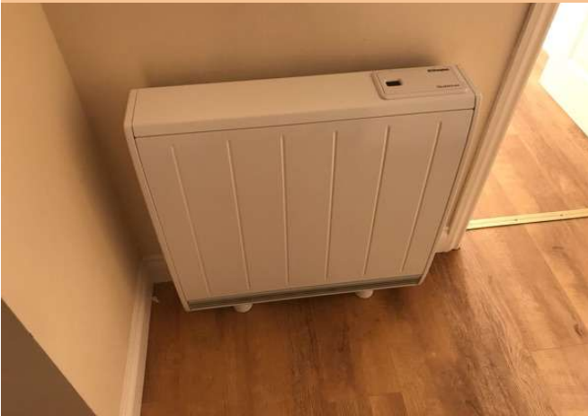
22-11-2024 15:30 / Hallway Photo / Ad4mmbh7p