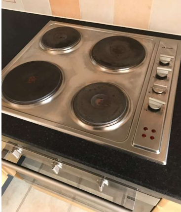
Rust signs on hob

09-08-2025 15:33 / Appliances / Qnf0vv2ig